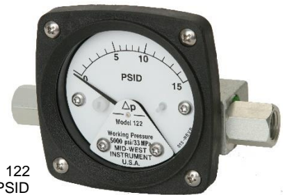
Model 122 0-15 PSID

An optional maximum indication follower pointer provides automatic indication of maximum differential occurring during a time period or system cycle. Reversed pressure ports are optionally available to facilitate installation and readability depending on which side of a filter, etc., the instrument must be installed.