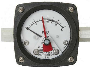
Model 122 0-30 PSID 2-1/2" Dial w/Maximum Follower Pointer

Due to precision sizing of piston and body bore, leakage across piston will not exceed 32 SCFH air at 100 PSID at ambient temperature.