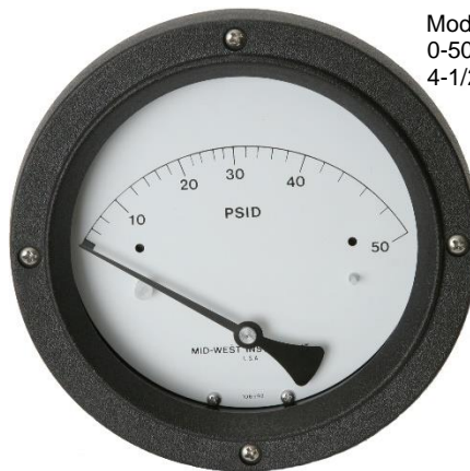
Model 122 0-50 PSID 4-1/2" Dial