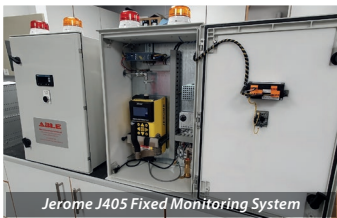
Jerome J405 Fixed Monitoring System

ABLE's Jerome J405 gold film mercury vapour analyser is used extensively throughout the electrical waste recycling industry. In our experience, companies typically want to implement both a mobile monitoring capability for general plant safety use and a stand-alone fixed-point analyser to police a potential vapour "hot spot". The go-to instrument for both applications is the proven Jerome J405 Gold Film Mercury Vapour Analyser. ABLE design and custom build system enclosures, applying our knowledge of delivering trace level sample concentrations with full integrity. Being able to detect mercury vapour in air at levels as low as 0.05 \mu\text{g}/\text{m}^3 ( 0.0005 \text{ mg}/\text{m}^3 ), the J405's LDL is well below the EU indicative occupational exposure limit value (IOELV) for mercury and its inorganic compounds of 0.02 \text{ mg}/\text{m}^3 (8-hour time-weighted average (TWA)).