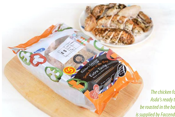
The chicken for Asda's ready to be roasted in the bag is supplied by Faccenda

The finished product is then stored in a temperature controlled chill room ready for early despatch to customers.