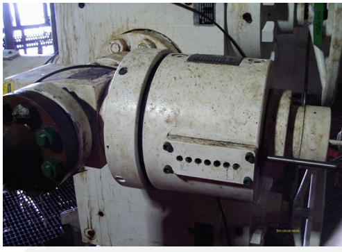
The Vetco Gray RHA-48

Continuous measurement of valve position, speed and uniformity of movement, allows diagnostic insight into the condition of the valves and hydraulic feeds. Improved maintenance planning and failure prediction are an additional benefit.